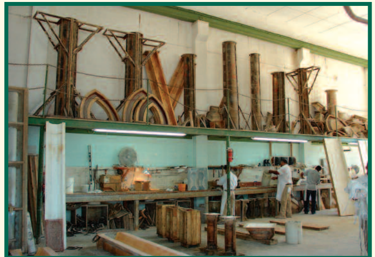
Herpel, Inc. in West Palm Beach

All events in the series are open to the public. They begin at 2:00 pm in the Rosenthal Lecture Room at the Preservation Foundation of Palm Beach, 311 Peruvian Avenue. Reservations are required. For additional information and reservations call 832-0731.