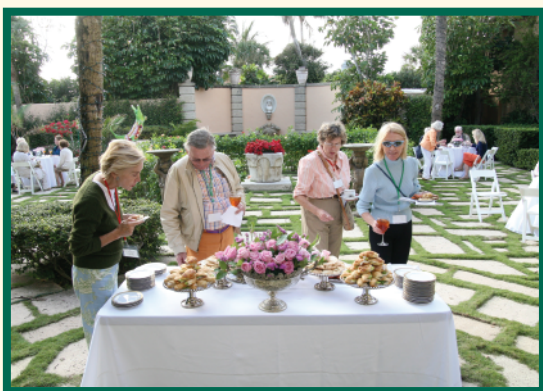
Tea in Vita Serena Garden